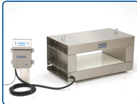
METAL SHARK® TU