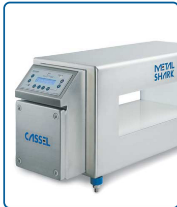
METAL SHARK® BD